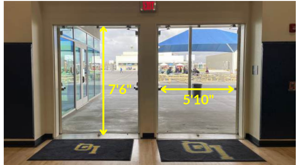
Exit Doors (2 double doors)