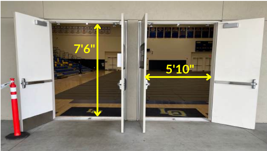
Entry Doors (2 double doors)