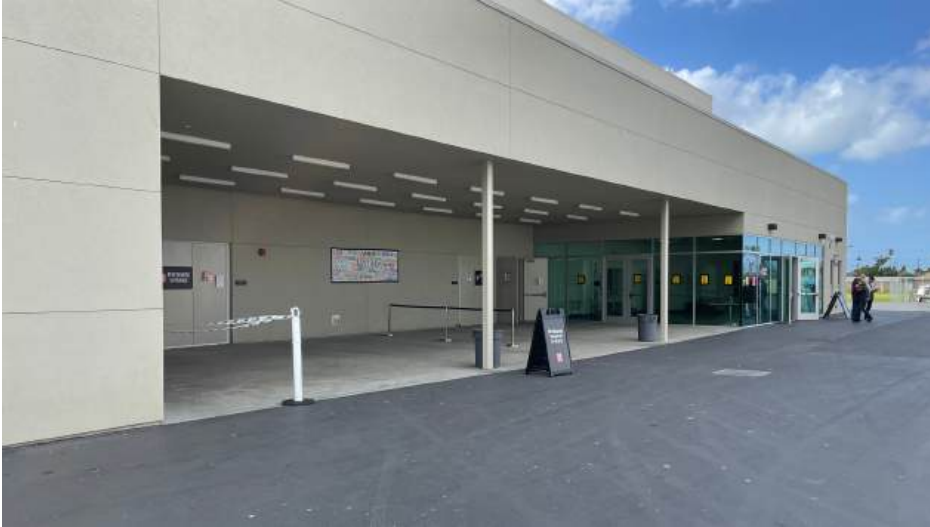
Covered Prestage Area